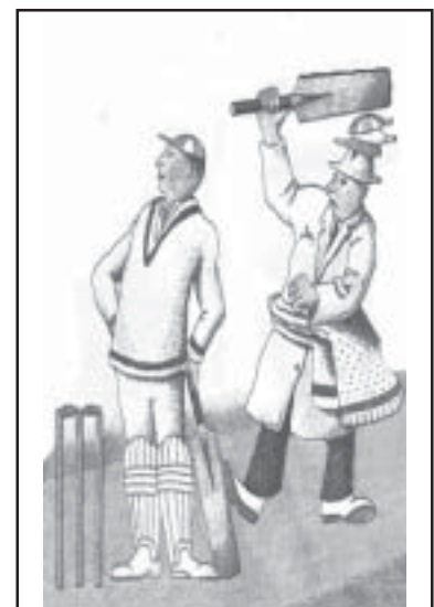
"The Umpire strikes back ..."

To dispute an umpire's decision by word, action or gesture to direct abusive language towards an opponent or umpire, or to indulge in cheating or any sharp practice. For instance to appeal knowing that the batsman is not out, to advance towards an umpire in an aggressive manner when appealing or to seek to distract an opponent either verbally or by harassment with persistent clapping or unnecessary noise under the guise of enthusiasm and motivation of one's own side.